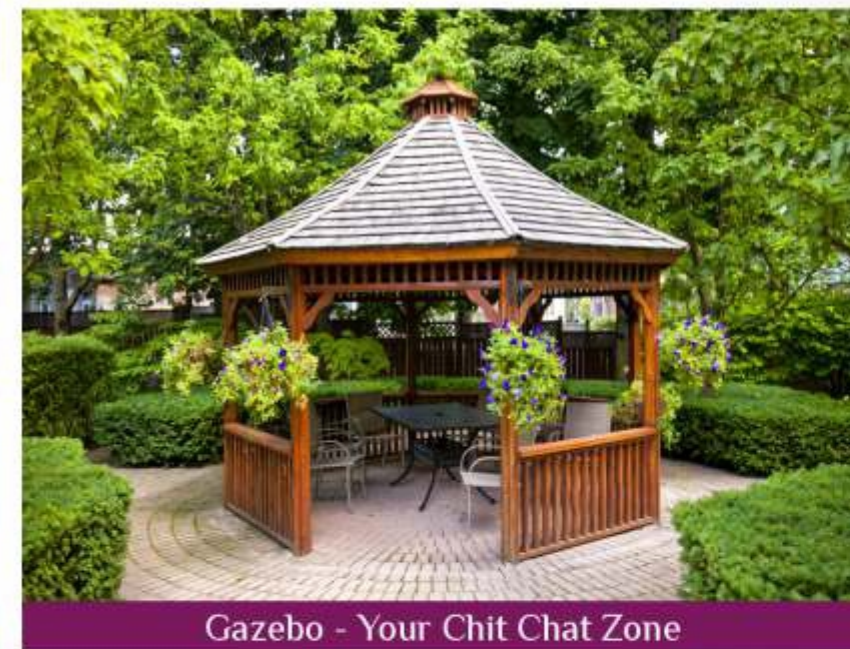
Gazebo - Your Chit Chat Zone