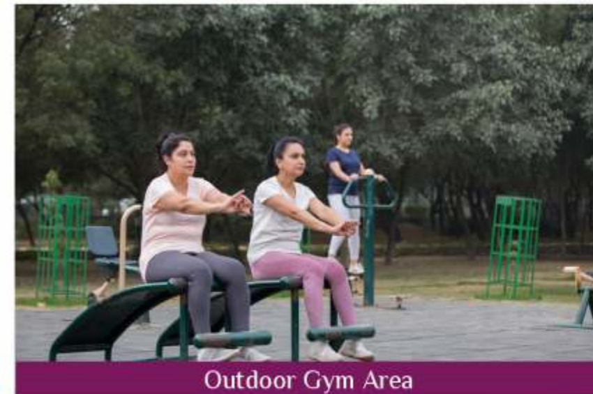
Outdoor Gym Area