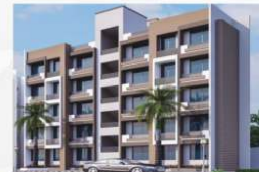
Priti Darpan, Saphale (W) Maha Rera Reg. No.: P99000022395