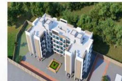
Priti Pearrl, Saphale (W) Maha Rera Reg. No.: P99000029964

We Don't Sell Flats, We Work with the Feeling "Humara Apna Ghar"