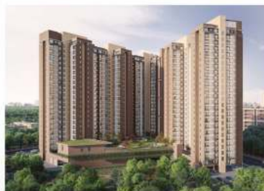
Nakshatra Aazstha, Vasai (E) Maha Rera Reg. No.: P99000051584