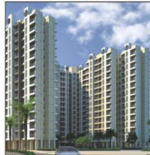
Nakshatra Primus, Naigaon (E) Maha Rera Reg. No.: P99000006041