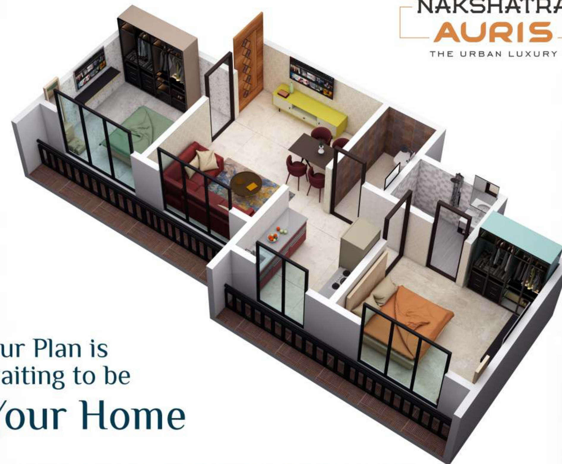
2BHK - 3D View