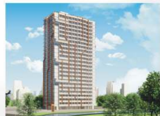
Nakshatra Trident, Virar (W) Maha Rera Reg. No.: P99000032964