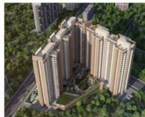
Nakshatra Veda I & II, Vasai (E) Maha Rera Reg. No.: P99000047826 / P99000048852