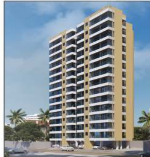
Nakshatra Tower, Mira Road (E) Pre - Rera Project