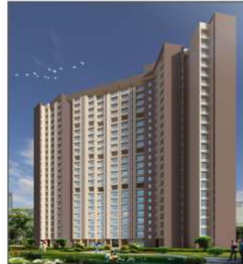
Current Project Nakshatra Aarambh, Naigaon (E) Maha Rera Reg. No.: P99000027563