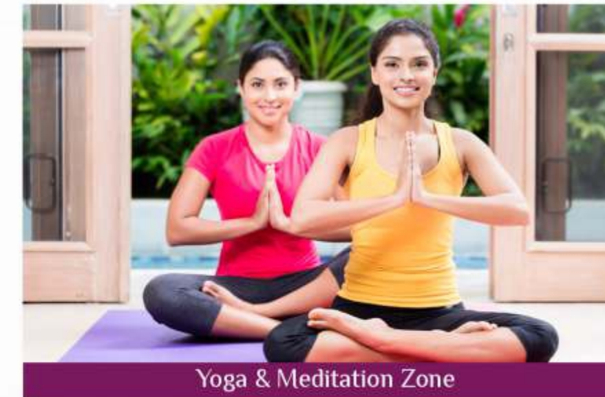
Yoga & Meditation Zone