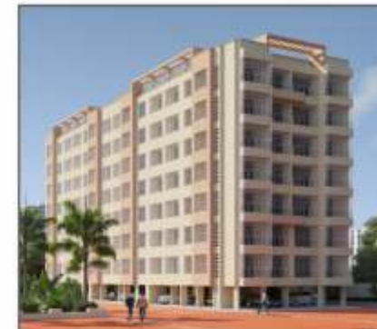
Garden Court, Bhayander (W) Pre - Rera Project