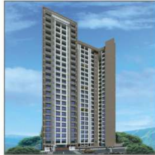
Current Project : Nakshatra Pride, Naigaon (E) Maha Rera Reg. No.: P99000017763 / P99000017789