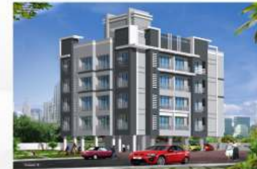
Midas Enclave, Nallasopara (E) Maha Rera Reg. No. P99000008488