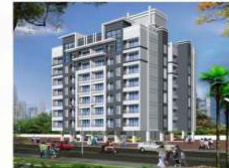
Midas Glory, Nallasopara (E) Maha Rera Reg. No. P99000006814