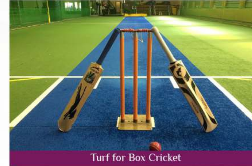
Turf for Box Cricket