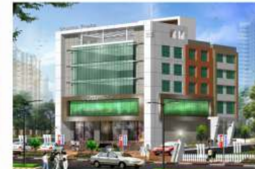
Pushp Plaza, Virar (E) Pre - Rera Project