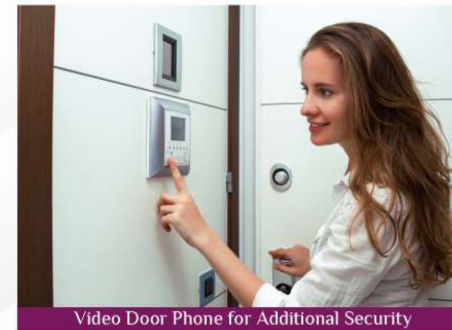
Video Door Phone for Additional Security