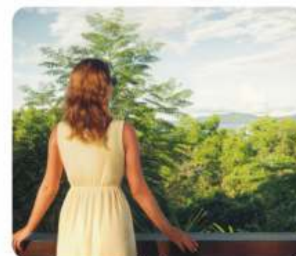
Natural Scenic Views