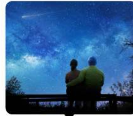
Star Gazing Point