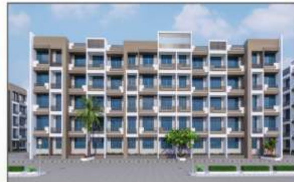
Nakshatra Residency, Saphale (W) Maha Rera Reg. No.: P99000027247