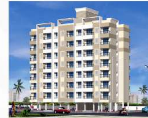
Rajlaxmi Apartment, Vasai (E) Pre - Rera Project