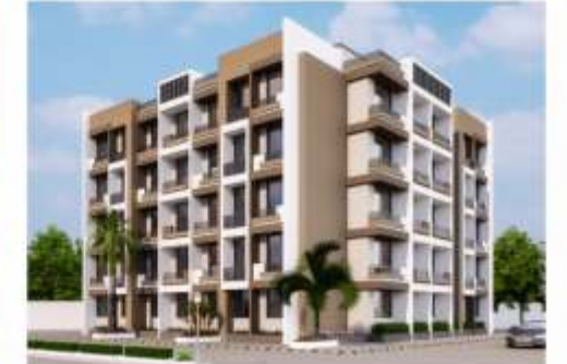
Priti Chaaya, Saphale (W) Maha Rera Reg. No.: P99000024244