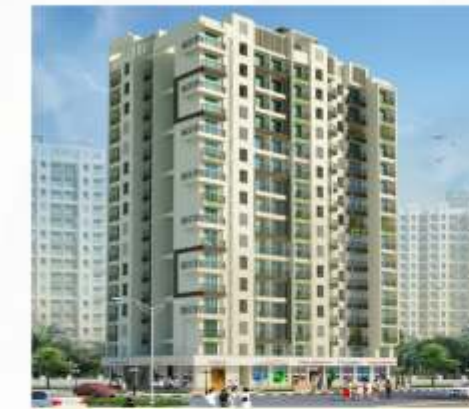
Midas Heights, Virar (W) Maha Rera Reg. No. P99000011085