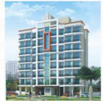
Shakun Solitarie, Vasai (E) Maha Rera Reg. No. P99000007677