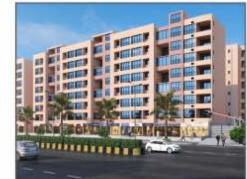
Ritu Paradise, Mira Road (E) Pre - Rera Project