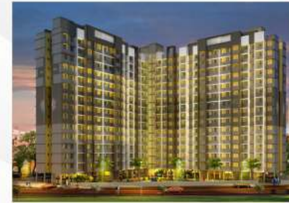
Raajlaxmi Tower, Vasai (E) Maha Rera Reg. No.: P99000022706